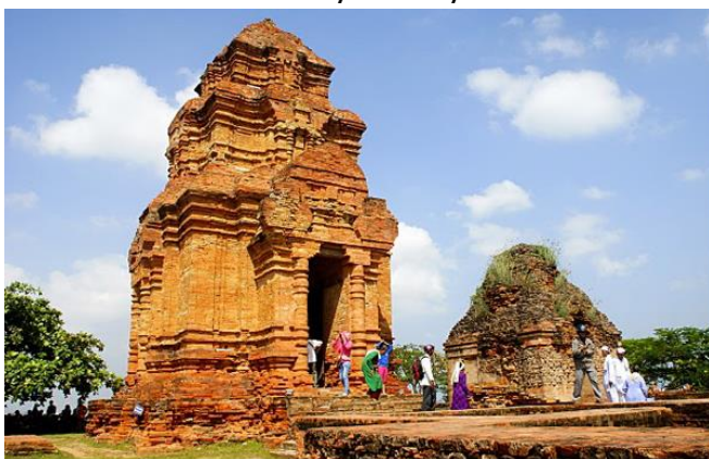
Poshanu Cham tower