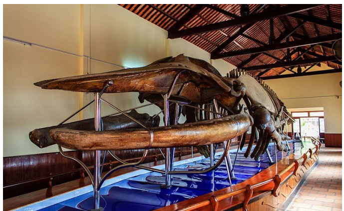
Van Thuy Tu temple