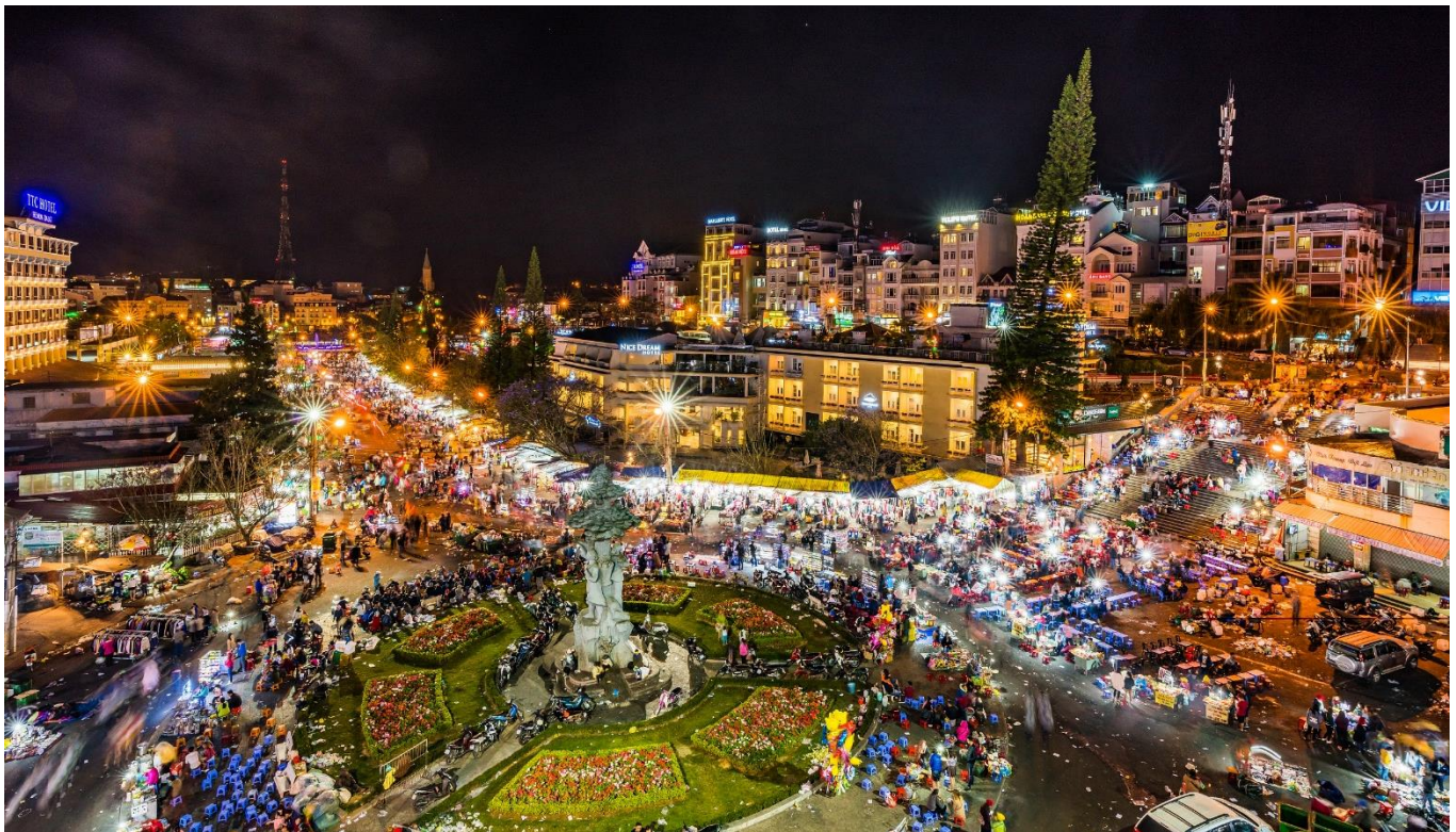
Dalat Night Market

Dinner at the local restaurant or enjoy Dalat’s local specialties. Then free time visiting Night Market .