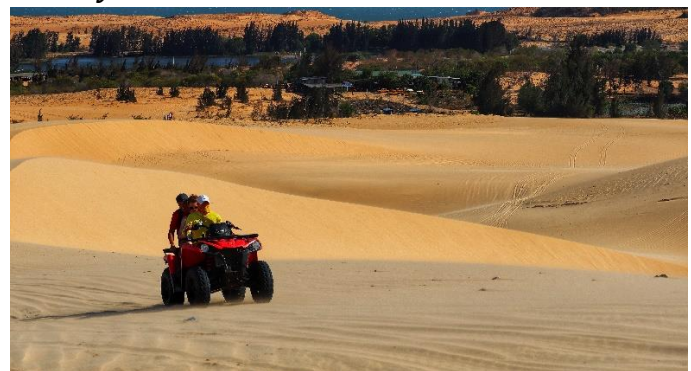
Sand dunes in Mui Ne