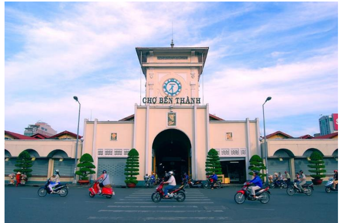
Ben Thanh Market