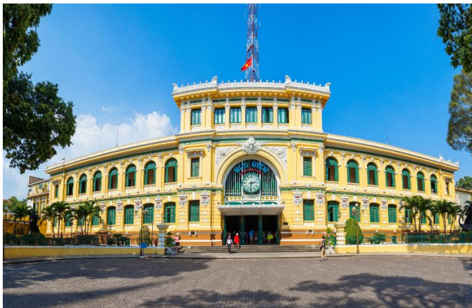
Centre Post Office

Tentative Flight: SQ178 SIN- SGN 09:45 10:55 (airfare excluded in quotation)